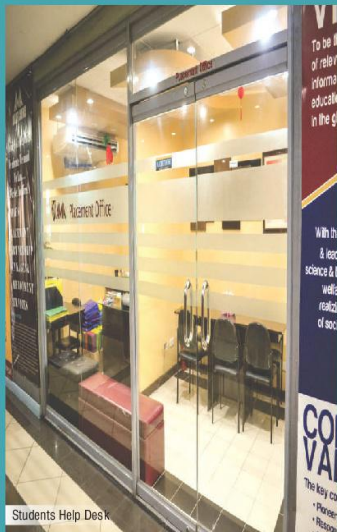
Students Help Desk