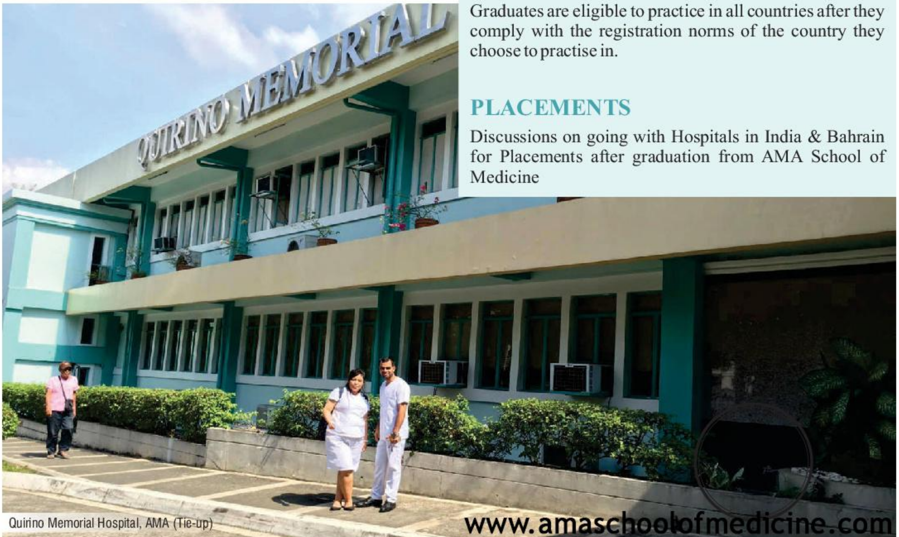
Quirino Memorial Hospital, AMA (Tie-up)

Discussions on going with Hospitals in India & Bahrain for Placements after graduation from AMA School of Medicine