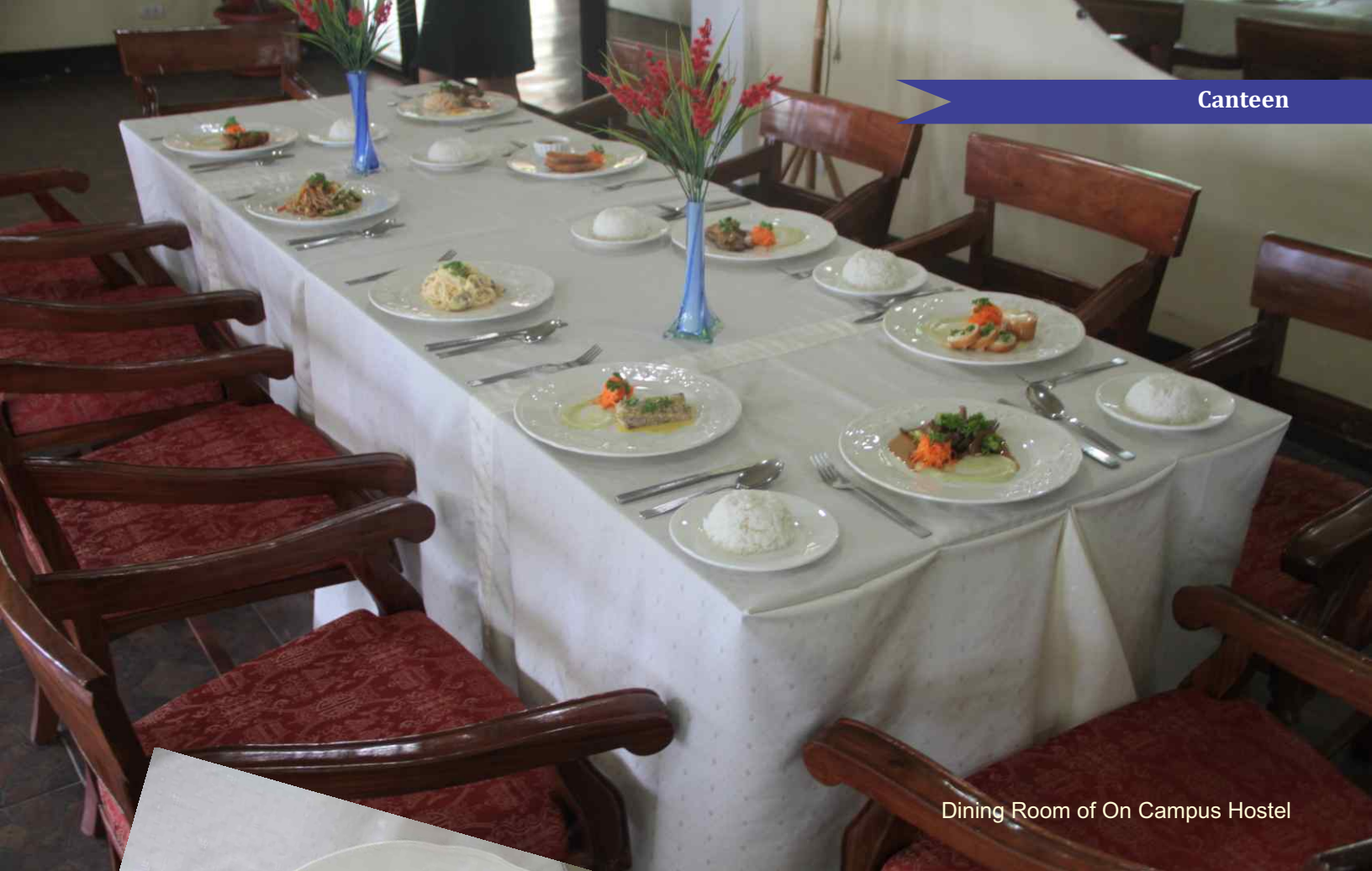
Dining Room of On Campus Hostel