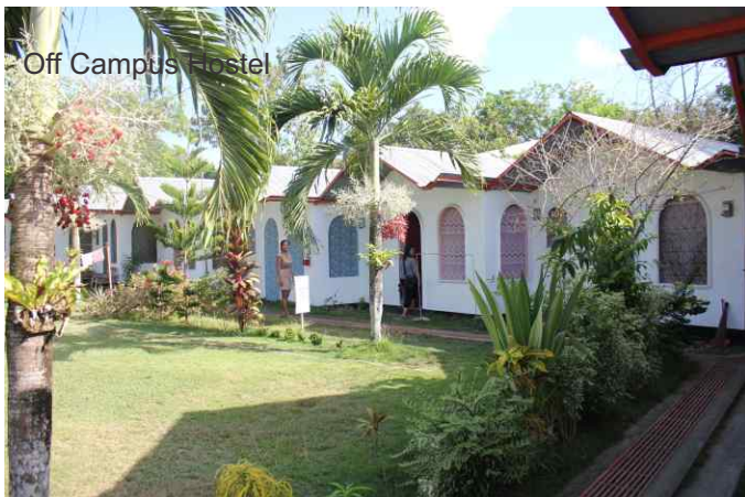
Off Campus Hostel